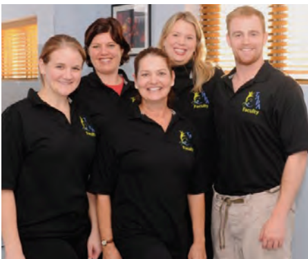
THE TAPA Faculty

We thank all of you who have helped us get started down the path of making our vision a reality, especially in these tough financial times. We will need your continued support